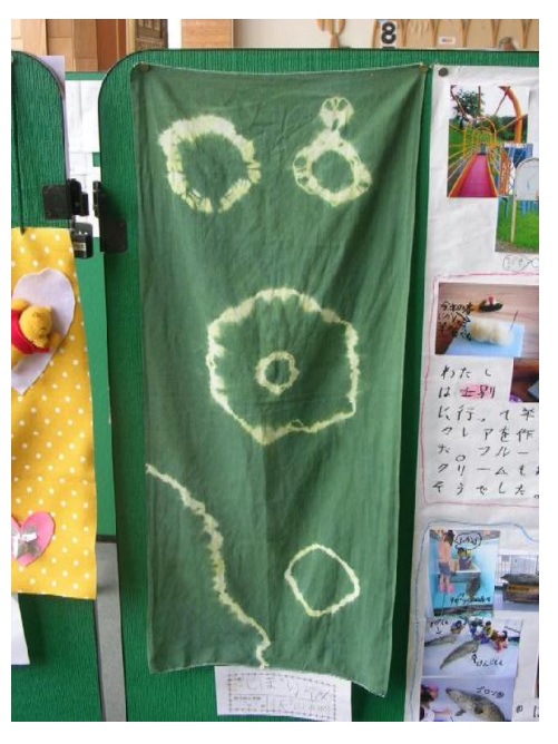
Dyed cloth by grade 3 student.